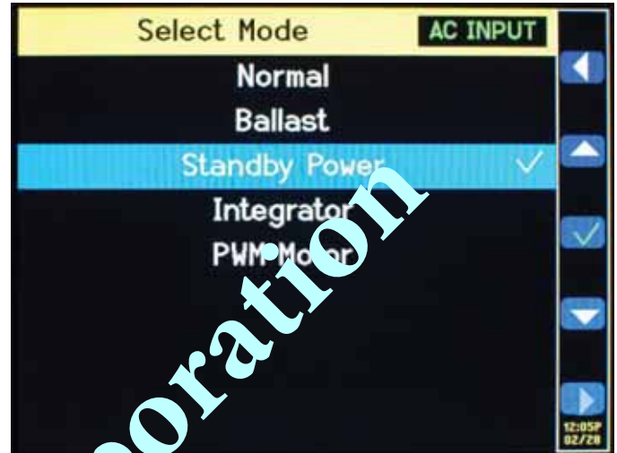
Selection of application-specific test modes.

Some applications require special instrument settings to ensure proper measurements. The PA4000 simplifies setup for these applications by automatically choosing instrument settings and parameters that are optimized for each type of measurement application, resulting in more reliable measurement results with less opportunity for user setup error.