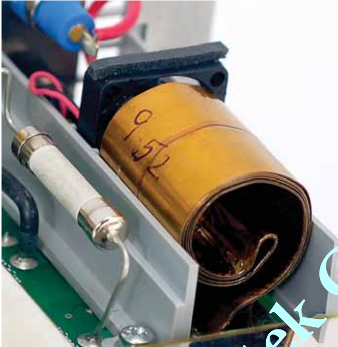
Spiral Shunt for 30 A input

The PA4000 employs an innovative Spiral Shunt design that ensures stable, linear response over a wide range of input current levels, ambient temperatures, crest factors, and other variables. This new design is superior to other shunt technologies and contributes to the instrument's reliable accuracy and repeatability over a wide range of signal conditions common in today's power conversion technologies. The spiral construction not only minimizes stray inductance (for optimum high frequency performance) but also provides for high overload capability and improved thermal stability.