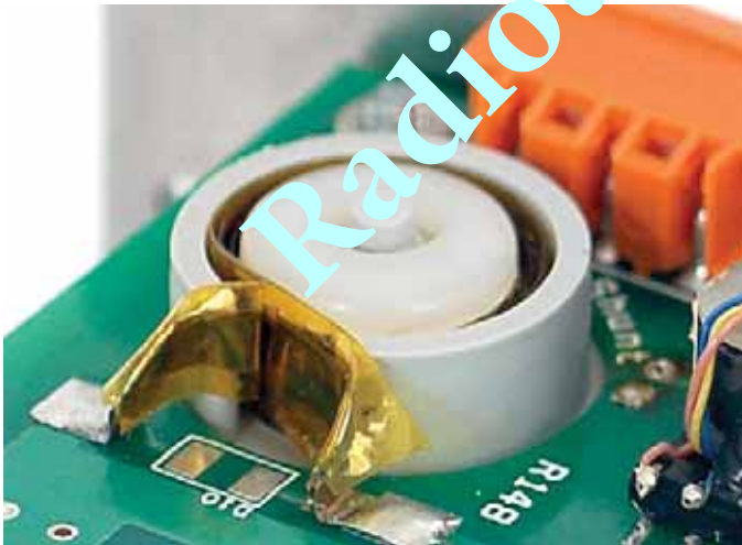
Spiral Shunt for 1 A input