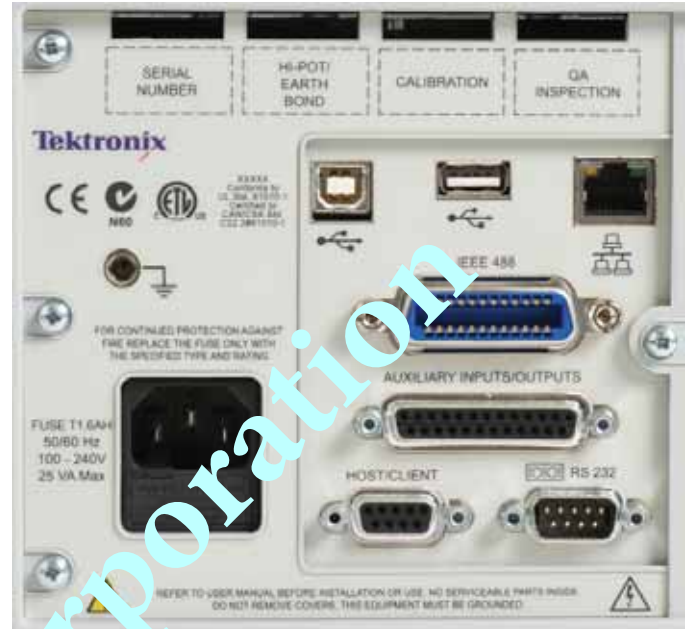
PA4000 front panel, with communication ports

The PA4000 comes standard with USB, Ethernet, and RS-232 communication ports, plus a front-mounted USB port for data export to a flash drive. GPIB is available as a factory-installed option.