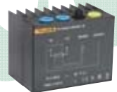
32 A Planar Shunt