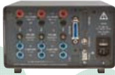
Fluke Norma 4000 (rear view)