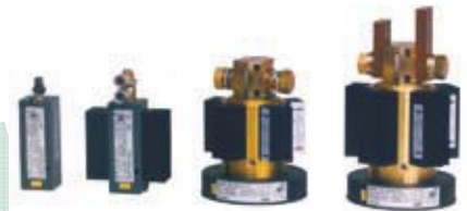
Optional shunts for Fluke Norma Series Power Analyzers

The input modules can take up to 10 A or 20 A directly or measure current via wideband precision shunts. The available range of shunts enables measurements up to 1500 A and can be used in conjunction with all of the available input modules.