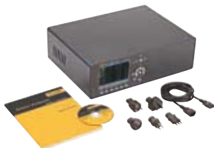
Fluke Norma 5000