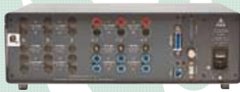
Fluke Norma 5000 (rear view)