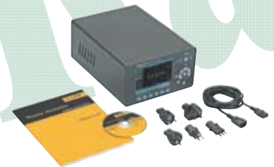
Fluke Norma 4000