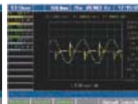
Digital Oscilloscope (DSO) mode