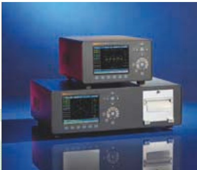
Fluke Norma Series Power Analyzers