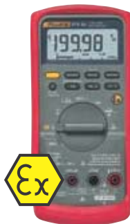
Fluke 87V Ex