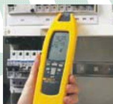
Location of fuses/breakers and assignment to circuits